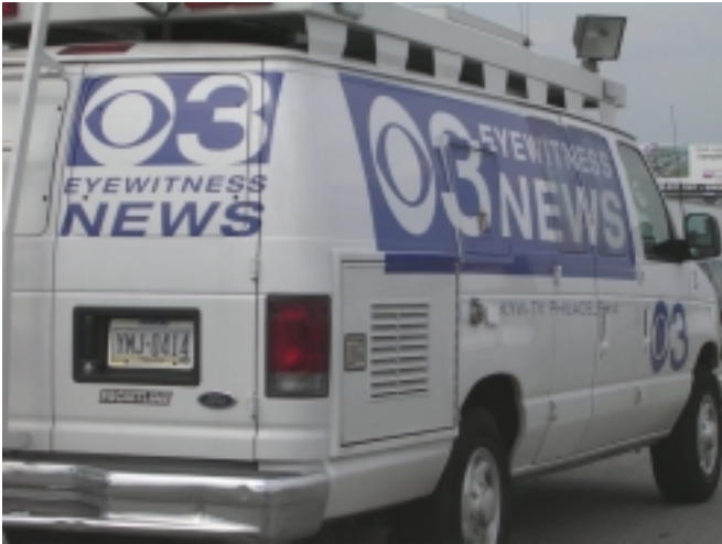
Philadelphia – KYW-TV3 (CBS) ENG news van en route to another assignment after a live feed.